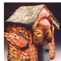
cast paper sculpture

To see Barbara's art go to www.paperdimensions.com