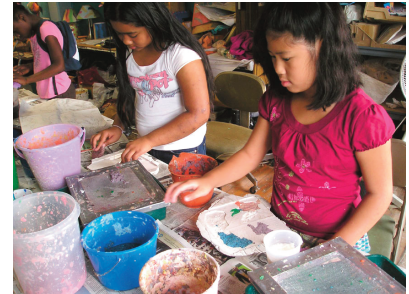
Paper Casting in the studio