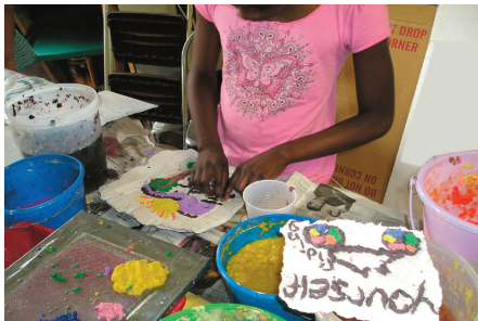
Working with paper pulp

Her vision for future workshops with children is to continue working with a combination of writing and sculptural illustration.